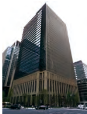
SMBC East Tower in Tokyo

· As the Osaka Head Office building was built over 80 years ago, the two-year renovation of the building was completed in May 2015. For the renovation, we have installed high-performing exterior wall frames, LED lightings and solar panels while retaining the original charm of the facilities, by