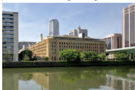
Osaka Head Office

substantially improving the environmental performance in addition to appropriately adapting to modern work styles.