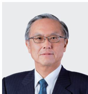
Chairman of the Board