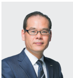
Director Director of SMBC

1986 Joined Sumitomo Bank 2014 Executive Officer of SMBC 2015 General Manager of Corporate Planning Department of the Company 2016 Managing Executive Officer of SMBC 2017 Managing Executive Officer of the Company 2019 Director and Managing Executive Officer of SMBC Senior Managing Corporate Executive Officer of the Company Director and Senior Managing Executive Officer of SMBC (to present) Director Senior Managing Corporate Executive Officer of the Company (to present)