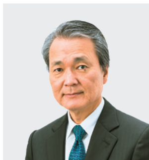
Director Chairman of Nippon Life Insurance Company