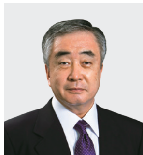
Director Certified public accountant