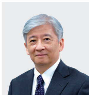
Director Attorney at law