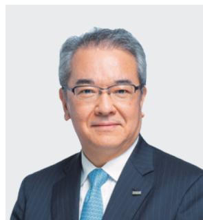
Director President of SMBC

1982 Joined Sumitomo Bank 2009 Executive Officer of SMBC 2012 Managing Executive Officer of SMBC 2013 Managing Executive Officer of the Company 2014 Senior Managing Executive Officer of the Company Senior Managing Executive Officer of SMBC Director of the Company 2015 Director and Senior Managing Executive Officer of SMBC 2017 Director and Deputy President of the Company Resigned as Director of SMBC Director Deputy President and Corporate Executive Officer of the Company 2018 Director and Deputy President of SMBC 2019 Director President of the Company (to present) Resigned as Director of SMBC