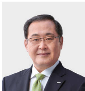
Director President (Representative Corporate Executive Officer) Group CEO

1976 Joined Sumitomo Bank 2003 Executive Officer of Sumitomo Mitsui Banking Corporation ("SMBC") 2006 Managing Executive Officer of SMBC 2007 Managing Executive Officer of the Company Director of the Company 2009 Director and Senior Managing Executive Officer of SMBC 2011 President and Chief Executive Officer of SMBC 2017 President of the Company Resigned as Director of SMBC Director President of the Company 2019 Chairman of the Board of the Company (to present)