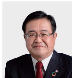
Director Representative Director, Chairman of SMBC Nikko

1984 Joined Sumitomo Bank 2006 General Manager of Legal Department of SMBC 2013 Co-General Manager of General Affairs Department of the Company 2015 Senior Manager of Head Office of SMBC Standing Corporate Auditor of the Company 2017 Director of the Company (to present)