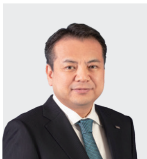
Director Senior Managing Corporate Executive Officer Group CFO, Group CSO Director and Senior Managing Executive Officer of SMBC