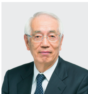
Director Special Advisor of Central Japan Railway Company