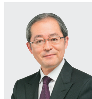
Director Former diplomat