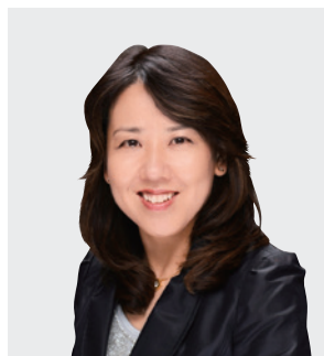
Director Chairperson and CEO of Dow Toray Co., Ltd