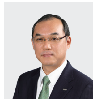
Director Senior Managing Corporate Executive Officer Group CRO Director and Senior Managing Executive Officer of SMBC

1982 Joined Sumitomo Bank 2009 Executive Officer of SMBC 2012 Managing Executive Officer of SMBC 2014 Senior Managing Executive Officer of SMBC 2016 Director and Senior Managing Executive Officer of SMBC 2017 President of SMBC (to present) Director of the Company (to present)