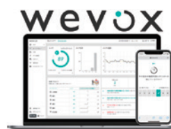
Engagement survey (wevox)

Meanwhile, engagement surveys are instituted to track levels of employee engagement and facilitate self-driven improvements by organizations. Employee awareness surveys are also conducted to develop an understanding of the levels of desire for coordination and solidarity among Group employees. These surveys have found that the average level of satisfaction among employees is at the high level of around 70%.