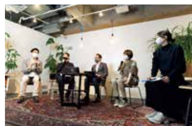
GREEN×GLOBE Partners event

For more information on GREEN×GLOBE Partners, please refer to the Sumitomo Mitsui Financial Group's corporate website (Japanese only). https://ggpartners.jp/