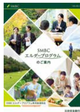
SMBC Elder Program Pamphlet

* 2 Program designed to facilitate learning of the various issues faced in an aging society, including healthcare, nursing care, social security, and other matters pertaining to the mental and physical well-being of senior citizens