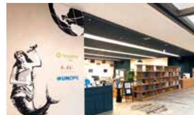
hoops link kobe