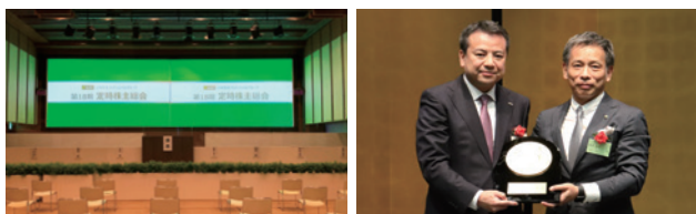
The 18th Ordinary General Meeting of Shareholders