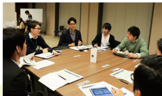
Discussion on formulation of the new Medium-Term Management Plan

In addition, SMBC holds the “SMBC Pitch Contest,” which provides opportunities for all domestic and overseas employees to present their business ideas directly to top management. Business ideas that have won previous contests have since been transformed into new products and services.