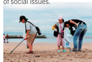
Clean-up activity at Suma Beach in Hyogo Prefecture

For example, our employees and their families have taken part in numerous volunteer activities, including post-disaster restoration activities and clean-up activities in various regions. In addition, employees coordinate with NPOs through pro bono activities to help contribute to the resolution of social issues.