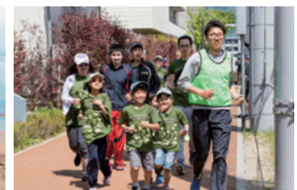
Running event aimed at fostering exchanges with the community