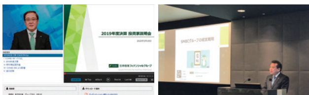
Investors briefing video presentation

Even faced with the COVID-19 pandemic, we endeavored to prevent declines in the quality of disclosure. As one effort for this purpose, the May 2020 investors briefing was conducted in the form of a video presentation by the Group CEO broadcast via the Internet and the question and answer session was carried out via teleconference.