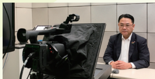
Video message to employees (SMBC Nikko Securities)