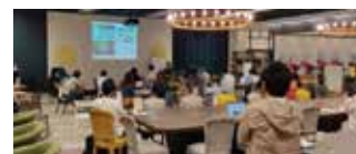
hoops link kobe

At the same time, we will continue to work with local government entities and regional financial institutions across Japan, drawing on SMBC Group's network to contribute to local economies through regional revitalization.