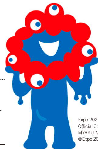
Expo 2025 Official Character MYAKU-MYAKU ©Expo 2025