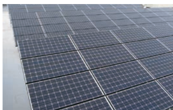
Solar power generation equipment at Group's main computer center

In fiscal 2012, we exceeded our initial target of 30% reduction by reducing 40% of CO 2 emissions. Taking into consideration this result, we continue to proactively install highly environment-friendly systems such as LED lightings