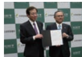
Ceremony commemorating the industrial development cooperation agreement concluded between the city of Kobe and SMBC

We will continue to work with local government entities and regional financial institutions across Japan, drawing on SMBC Group's network to contribute to local economies through regional revitalization.